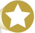
REAL ID Gold Star Designation

Printed information about REAL ID is available at Drivers facilities, libraries, and state government offices. Check the www.wlsu.weebly.com under Related Articles and Videos for a full explanation of what you need to bring to the DMV to get your new license.