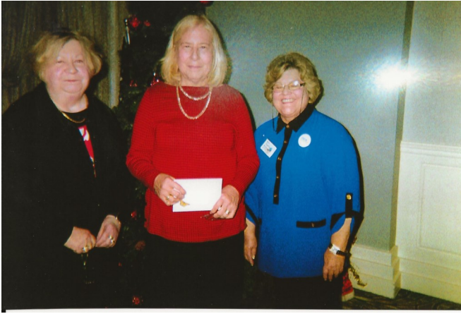
Presidents—Past, Present, Future